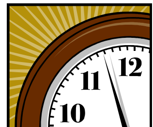
Why are they called minutes anyway?

"I bet you'll start sweating big time if I turn it OFF"