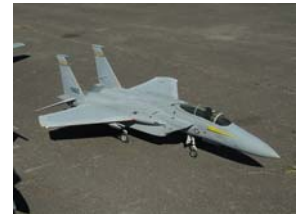
Turbine Powered F-15 Flown By Duke of Paradise Flyers