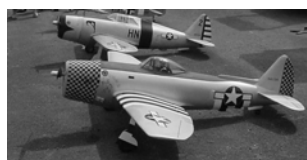
P-40 and P47