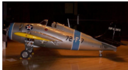
Extremely Scale F-4-F

Everyone went up to the upper level to view the static displays before looking at any of the booths. The display was good, but I heard it was smaller than last year. There was a good selection of models represented, everything from a four engine C130 to sport and pattern. A WW2 Avenger was on stage and it was quite spectacular. Also of note was the Cub and the P38. All the aircraft displayed were quite nice and worth the visit. Some of them are in the pictures I took there.