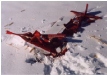
Contrary to popular belief, snow is NOT soft

For anyone interested in R/C it would be a nice visit if for nothing else to get information on what is happening in the industry and to get to talk to experts in the field. My son and I are certainly going back next year.